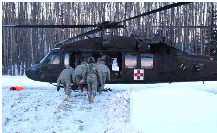
Soldiers conduct medical evacuation training at Fort Wainwright, Alaska.

The Department will pursue comprehensive engagement with allies and partners to protect the homeland and support civil authorities in preparing for increased human activity in the Arctic. Strategic partnerships are the center of gravity in ensuring a peaceful opening of the Arctic and achieving the Department’s desired end-state. Where possible, DoD will seek innovative, low-cost, small-footprint approaches to achieve these objectives (e.g., by participating