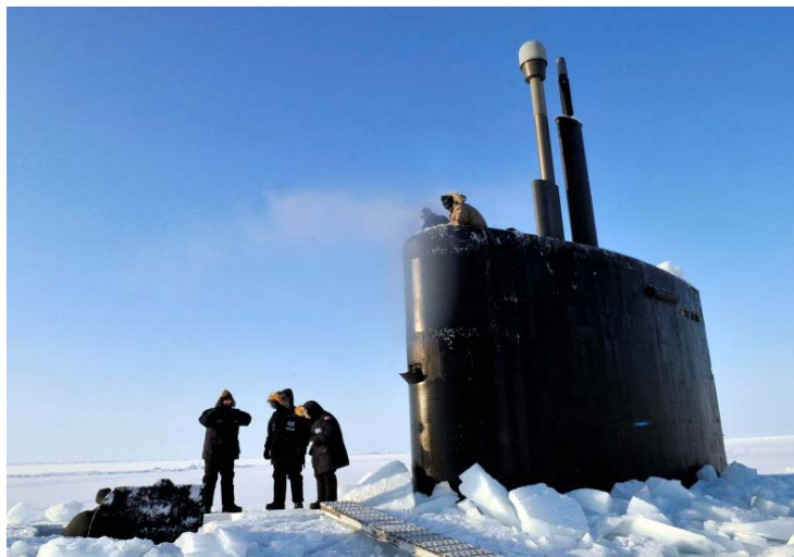
Members of the Applied Physics Laboratory Ice Station participate in Ice Exercise (ICEX) to assist operations and training in the challenging and unique environment that characterizes the Arctic region.

The Department's two supporting objectives describe what is to be accomplished to achieve its desired end-state. These objectives are bounded by policy guidance, the changing nature of the strategic and physical environment, and the capabilities and limitations of the available instruments of national power (diplomatic, informational, military, and economic). Actions taken to achieve these objectives will be informed by the Department's global priorities and fiscal constraints. In order to achieve its strategic end-state, the Department's supporting objectives are: