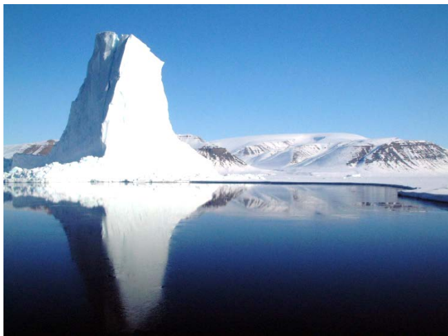
An iceberg at the edge of Baffin Bay's sea ice is just one of the many sights from Thule Air Base, Greenland.

The Arctic 1 is at a strategic inflection point as its ice cap is diminishing more rapidly than projected 2 and human activity, driven by economic opportunity—ranging from oil, gas, and mineral exploration to fishing, shipping, and tourism—is increasing in response to the growing accessibility. Arctic and non-Arctic nations are establishing their strategies and positions on the future of the Arctic in a variety of international forums. Taken together, these changes present a compelling opportunity for the Department of Defense (DoD) to work collaboratively with allies and partners to promote a balanced approach to improving human and environmental security in the region in accordance with the 2013 National Strategy for the Arctic Region . 3