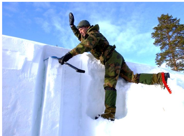
The threat of avalanche presents a real danger to Marines training in Norway's subarctic climate and rugged terrain.

Where appropriate, the Department will support other departments and agencies in maintaining human health; promoting healthy, sustainable, and resilient ecosystems; and consulting and coordinating with Alaska Natives on policy and activities affecting them. Finally, the Department will continue to integrate environmental considerations into its planning and operations and to contribute to whole-of-government approaches in support of the second line of effort in the 2013 National Strategy for the Arctic Region .