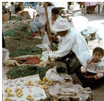
Dietary crops. A market, or tianguis , in Huauchinango, Mexico, with indigenous Mexicans and typical crop-based diets.

Kim et al. (4) combine mutational analysis and imaging to demonstrate an essential role for iron in seedling development—specifically, iron localized to an intracellular compartment called the vacuole in the model plant Arabidopsis thaliana . Although abundant, iron is relatively insoluble, and the challenge for all organisms is to acquire adequate amounts while avoiding toxicity (6). Iron is essential for oxygen transport throughout an organism and for cellular (mitochondrial) res-