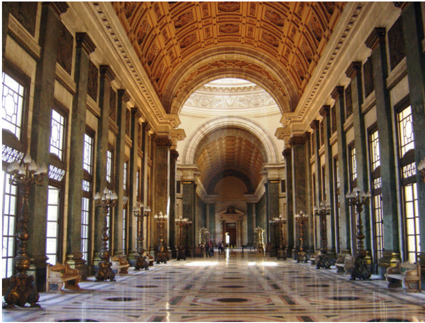
FIG. 5. Salon de los Pasos Perdidos, inside El Capitolio in Havana, venue of the V Congress of the Cuban Meteorological Society, 4 Dec 2007.

atmospheric infrastructure in the Caribbean that will form the backbone for a broad range of geoscience and atmospheric investigations and enable research on process-oriented science questions with direct relevance to geohazards (Braun et al. 2012). The significance of this project was that it created momentum in the Caribbean region for an international observational network to support geohazard research with